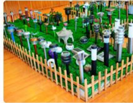
SHOWING ROOM I