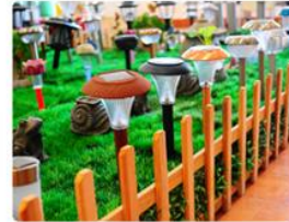
SHOWING ROOM II