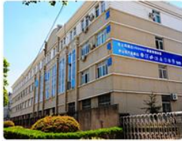
FACTORY FRONT GATE